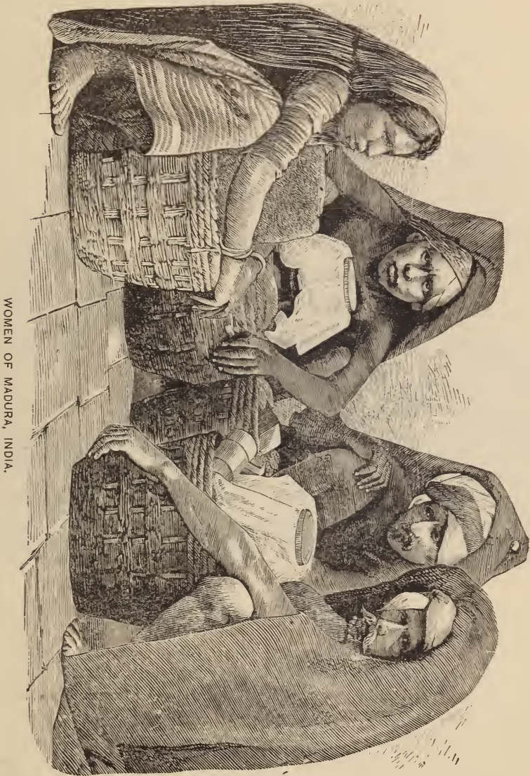
WOMEN OF MADURA, INDIA.

morning heard the joyful exclamation of 'Land! land!'" The day before reaching Calcutta, she added: "I wish my own dear mother could be a partaker of our pleasures. . . . This is the most delightful trial I ever had." "Whenever you think of me, think I am happy and contented; that I do not regret coming